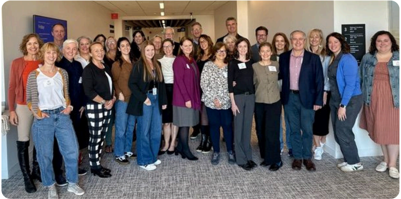
November 2025 NGO Convening in Bentonville, AK, U.S.A.

Addressing forced labor in tuna supply chains is an urgent priority . This year, the Alliance led a scoping process to understand the progress and challenges of current efforts to address forced labor at the vessel level. In November, the Alliance convened labor rights experts from seafood, cotton, minerals, apparel, and agriculture, along with seafood sustainability experts, to discuss what's needed to improve conditions for workers on tuna vessels supplying the U.S. market. The project team has also engaged with businesses and industry collaborations to solicit feedback and started outreach to local experts and worker organizations in Taiwan, Indonesia, and Korea. The input we received has been invaluable to help us refine the concept for an initiative to drive industry-wide action to address forced labor on tuna vessels supplying the U.S. market.